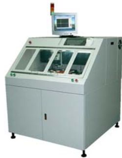
Router R2200 2x table with options to merge to 1x big table