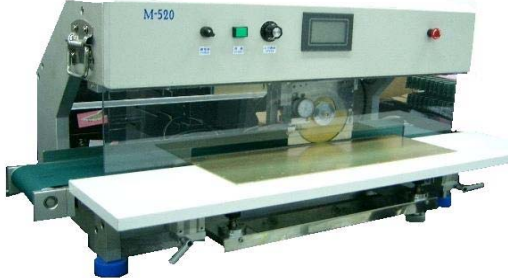
V-Groove Depaneliser Straight Cut with conveyor and safety cover