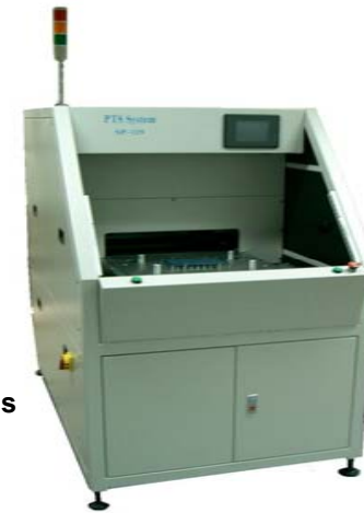
Singulation Press 30 tonnes