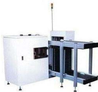
BareBoard/Mag Loader (2 in 1) Model: MBL2008