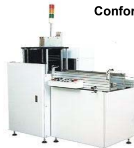
Buffer Stocker BS461