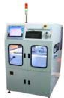
In-Line labeler LB1000 Pick n place printed labels onto PCBA or modules