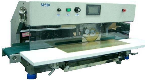
V-Groove Depaneliser Straight Cut with conveyor and safety cover