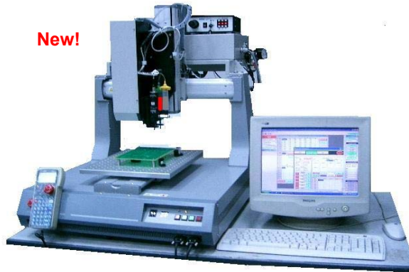
Damp & Fill -COB Encapsulation