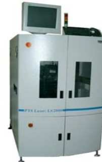
Laser Marker LS2000 Barcodes, 2D, logos, graphics ...