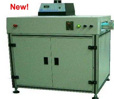
In-Line UV Ovens