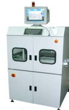
In-Line InkJet Marker MK1200