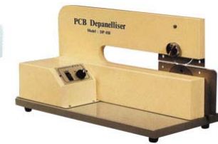
V Groove Depaneliser DP 108