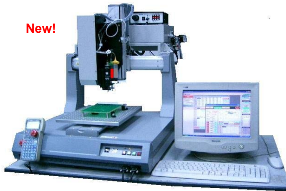
Damp & Fill -COB Encapsulation