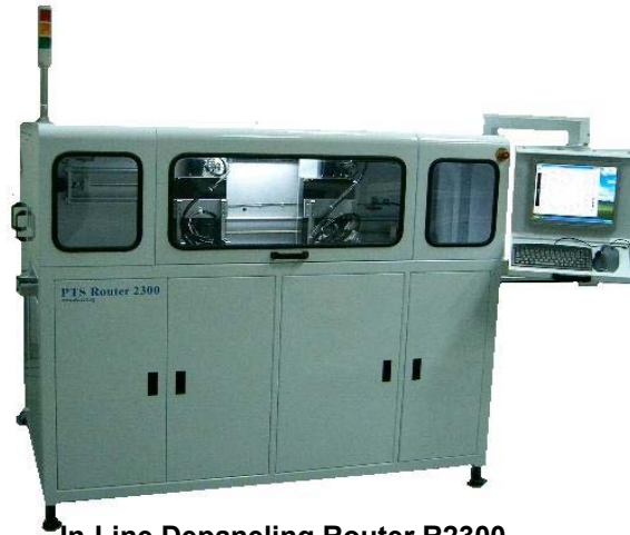
In-Line Depaneling Router R2300