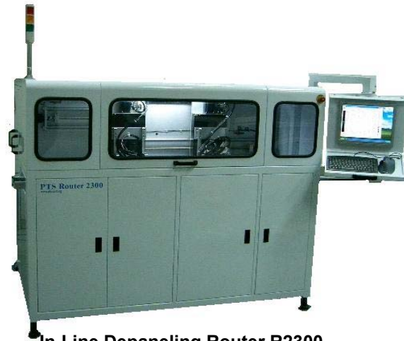
In-Line Depaneling Router R2300