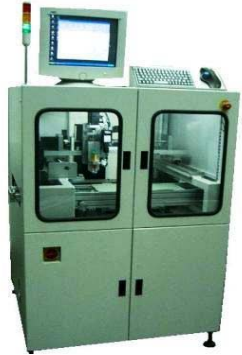
Precision Dispenser with fiducial ref & nozzle tip calibration