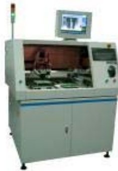
Router R2500 meets your budget without sacrificing performance