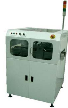
New! PCB Brushing System