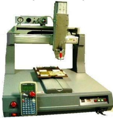
Epoxy or Solder Paste Dispenser