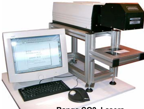
Range CO2 Lasers