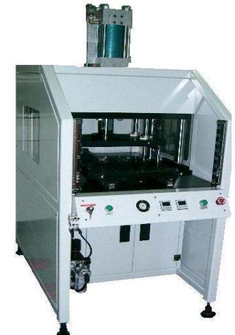
Singulation Press 8 tonnes