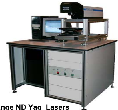
Range ND Yag Lasers

We integrate Lasers to meet your process requirements..... And other range of equipment & material handlers, conveyors..... Write to sales@pts.com.sg Tel: +65-67780300