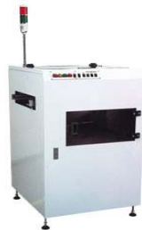
BareBoard Loader BBL2000