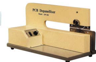
V Groove Depaneliser DP 108