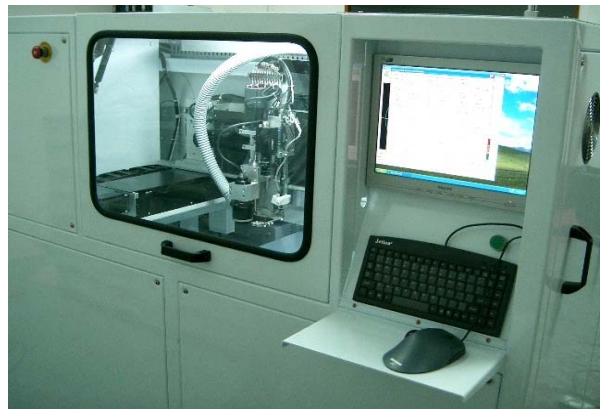
Back of machine where routing takes place.

Call or write to us to understand more . . .