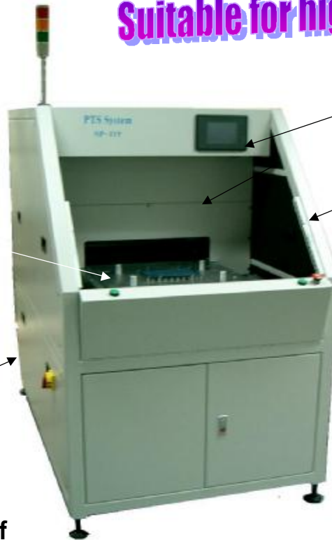
Touch screen controls