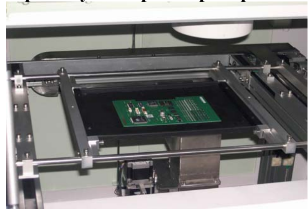
Larger rotating table for 3D view